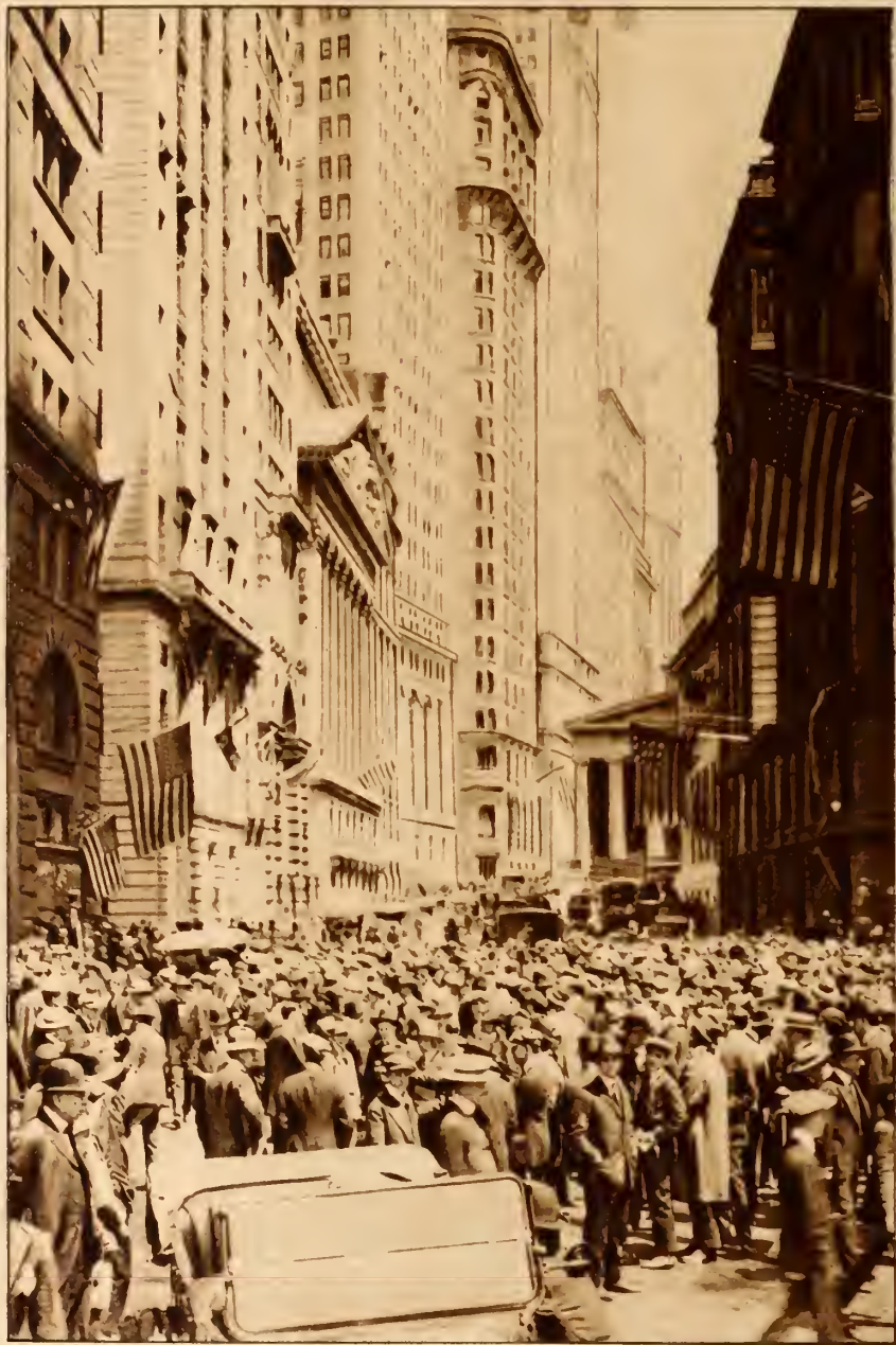
BROAD STREET CURB BROKERS, who deal in all stocks and securities not listed on the Exchange. These brokers have their offices in adjoining buildings.